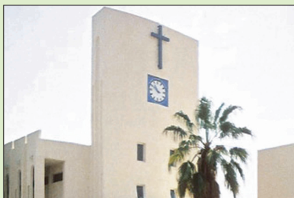
The NEC, Bahrain.