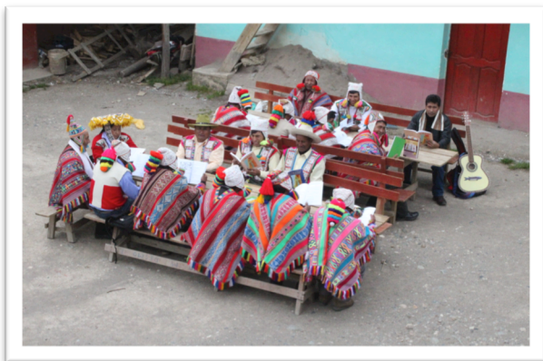
A study group in Cusco (South)