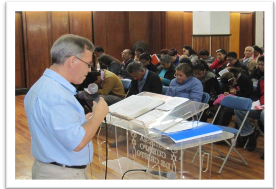
One of our Bible Study seminars