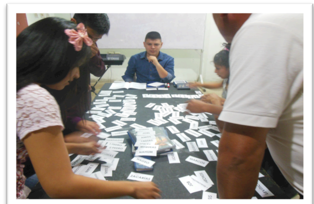
A study group in Pacanguilla (North)