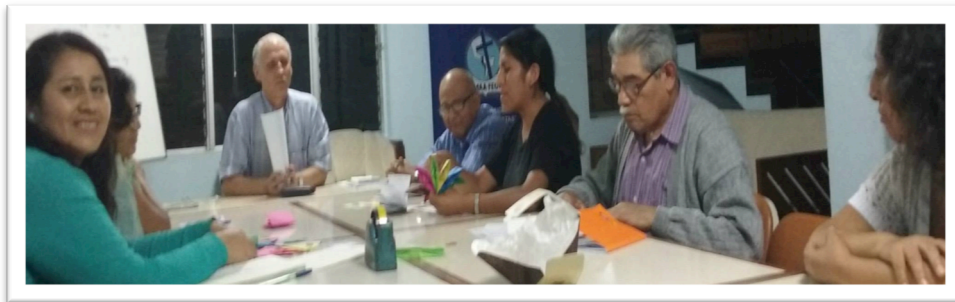
A Tutor training workshop