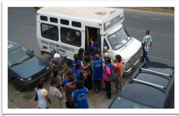
Students going on evangelistic outreach