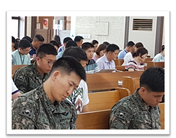
SEAN International, Ferndale, Cranston Road, East Grinstead, W Sussex RH19 3HL, UK. UK Registered Charity No. 286965